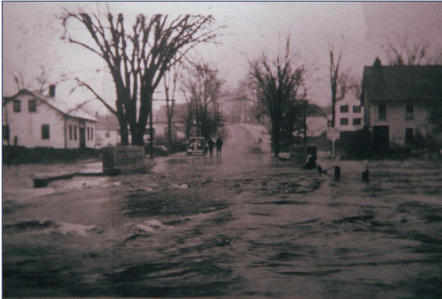
2008 Hazard Mitigation Plan cover: Marked as September 1938, Bridge on Route 114 in South Sutton (possibly was from 1936 March Flood)