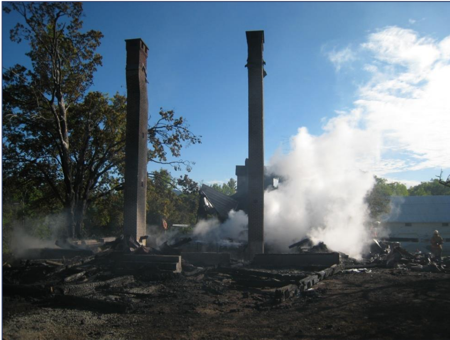
Eaton Grange Road Fire, June 2009