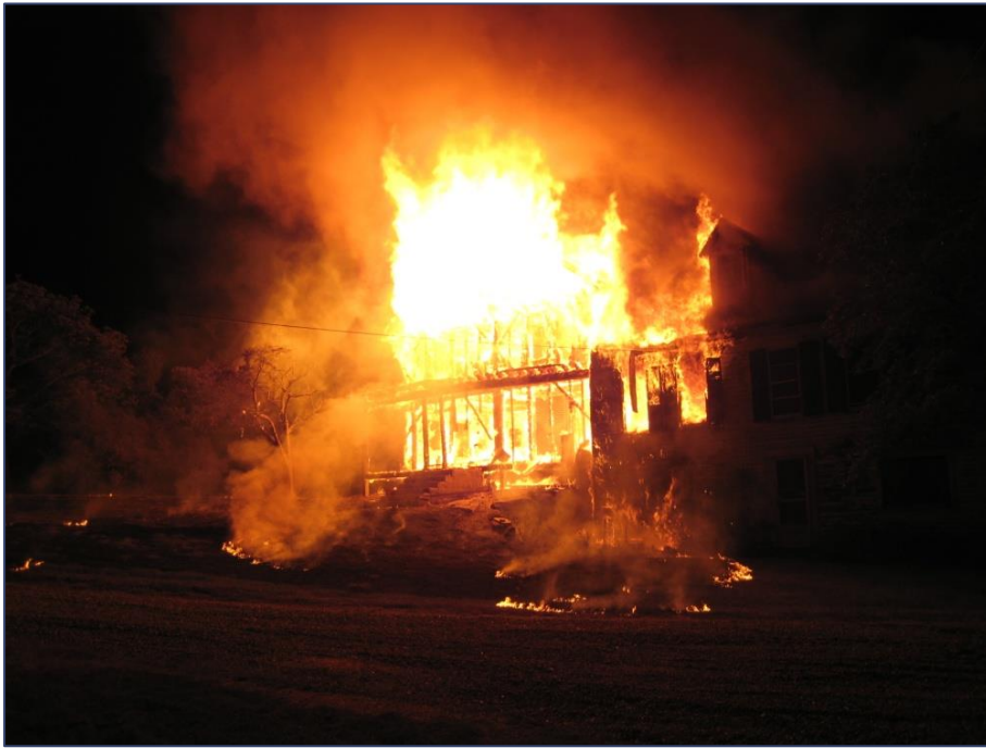
Eaton Grange Road Fire, June 2009