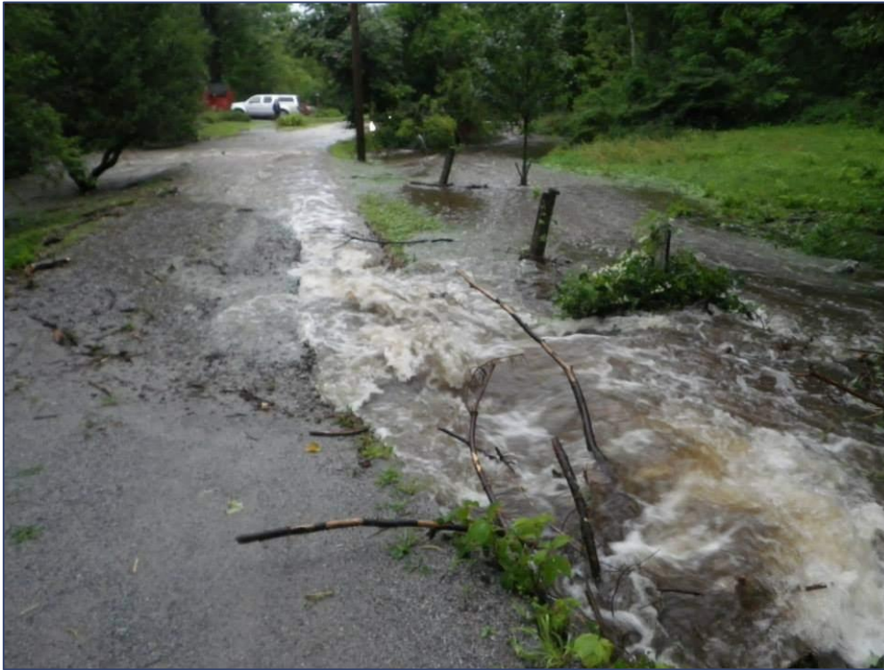
Severe road washouts on Dodge Hill Road during severe rainstorms, August 13, 2014