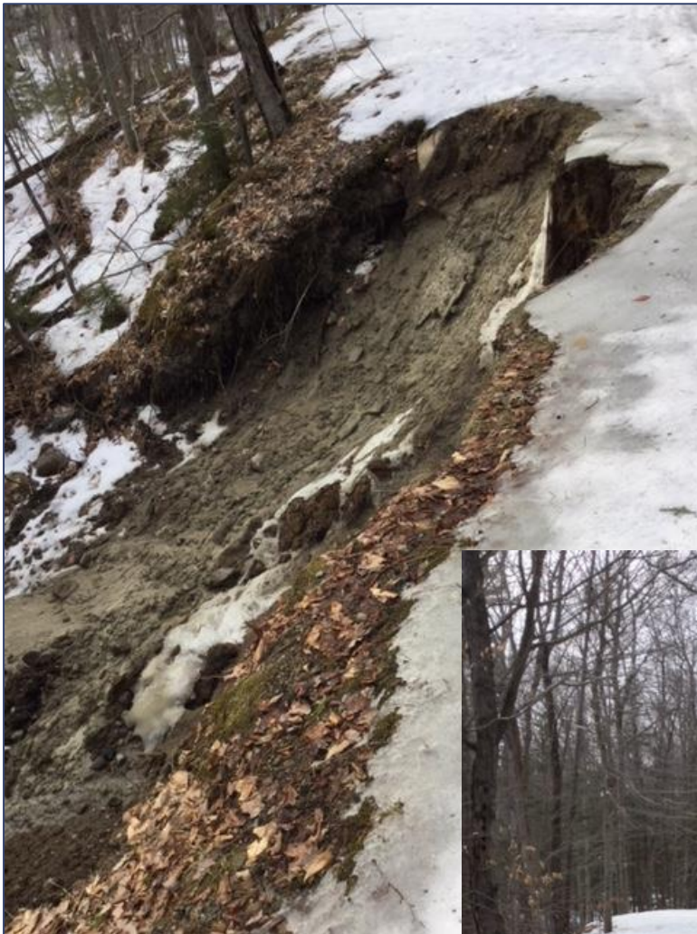
Kings Hill Road washout and erosion, before junction with Poor Farm Road, February 24, 2018