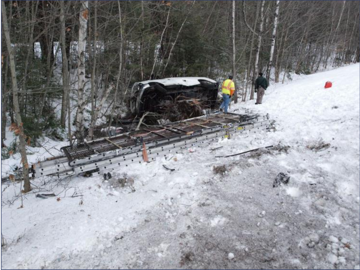
Interstate 89 passenger vehicle rollover crash in Sutton, December 7, 2018