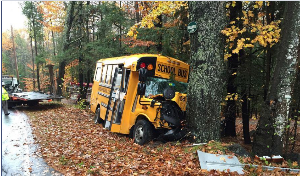
Small Kearsarge Regional School Bus crash (no children on board) crashes into tree on NH 114, Oct 24, 2014