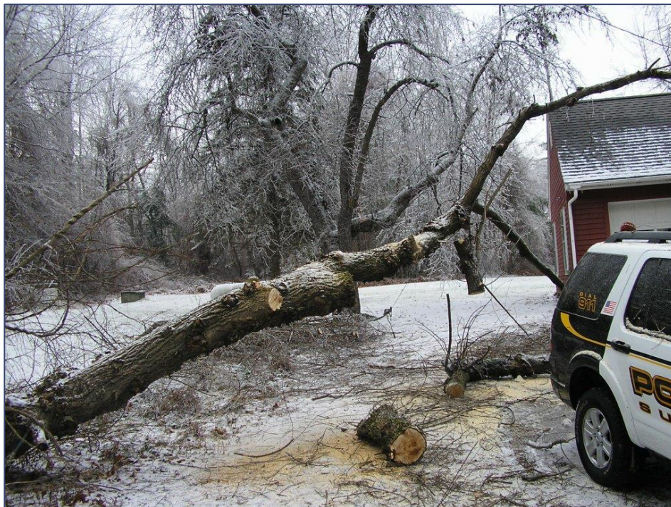
Tree Fall, December 2008