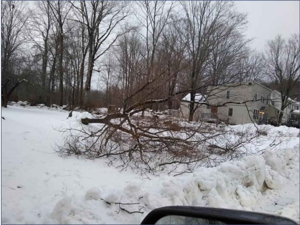
Snow storm accumulation and associated treefall on Blaisdell Hill Road, November 28, 2018