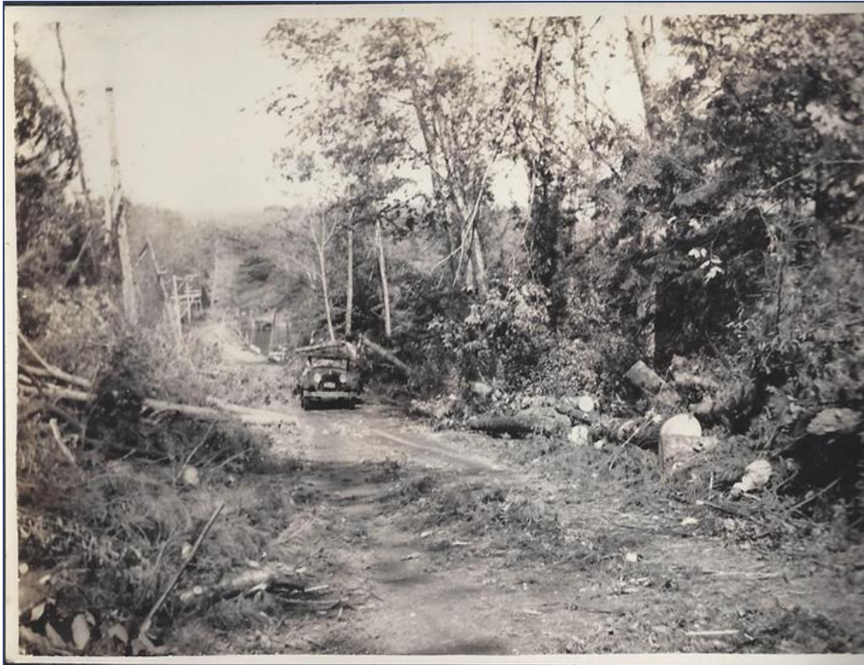
Route 114 North of Watkins Avenue, September 1938 Hurricane