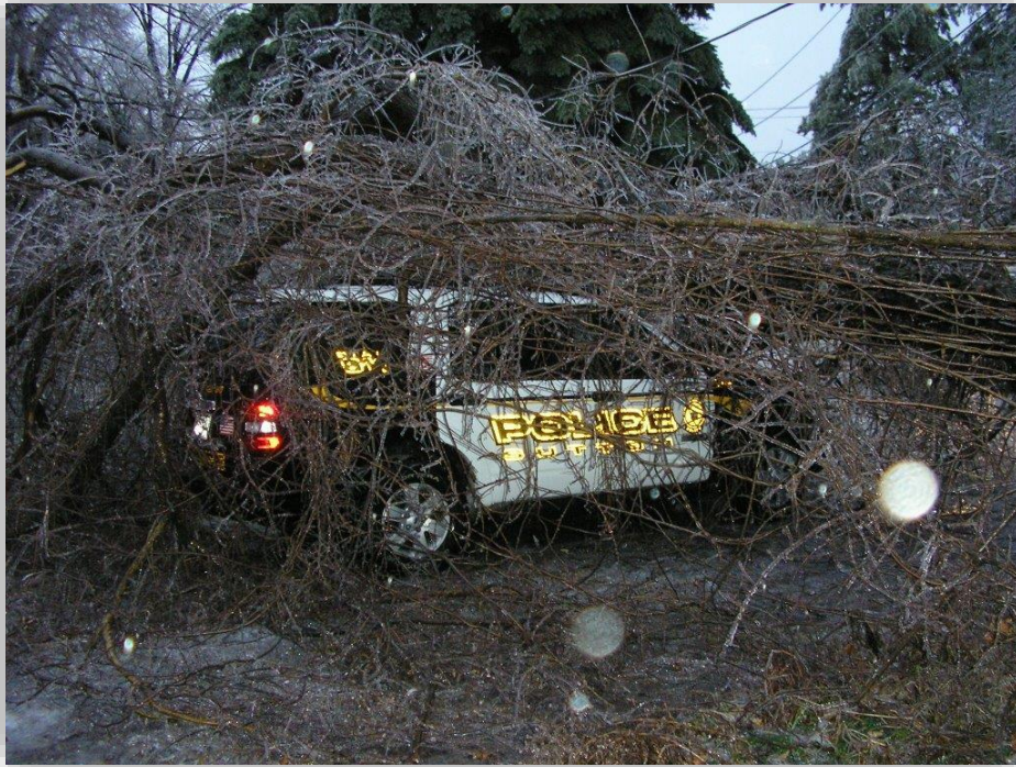
2014 Hazard Mitigation Plan cover: Sutton Police Cruiser, December 2008