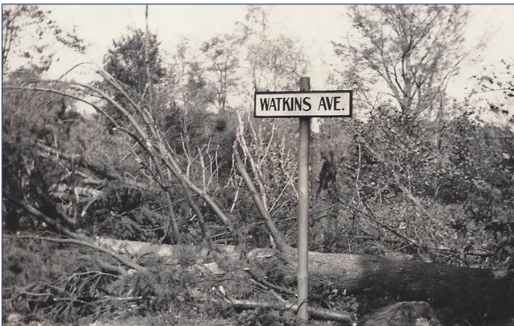
Route 114 at Watkins Avenue, September 1938 Hurricane