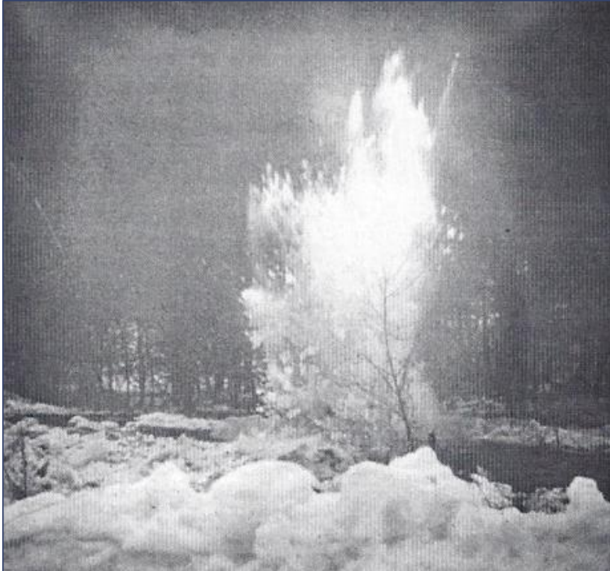
Photo courtesy of Sutton Historical Society. Photo excerpted from History of Sutton, New Hampshire, Volume II, by Jack Noon