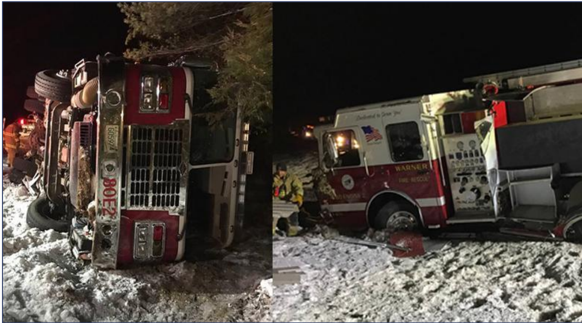
Warner Fire Department Engine Rollover on I-89 while responding to a Sutton call for assistance during March 12, 2017 Severe Winter Storm