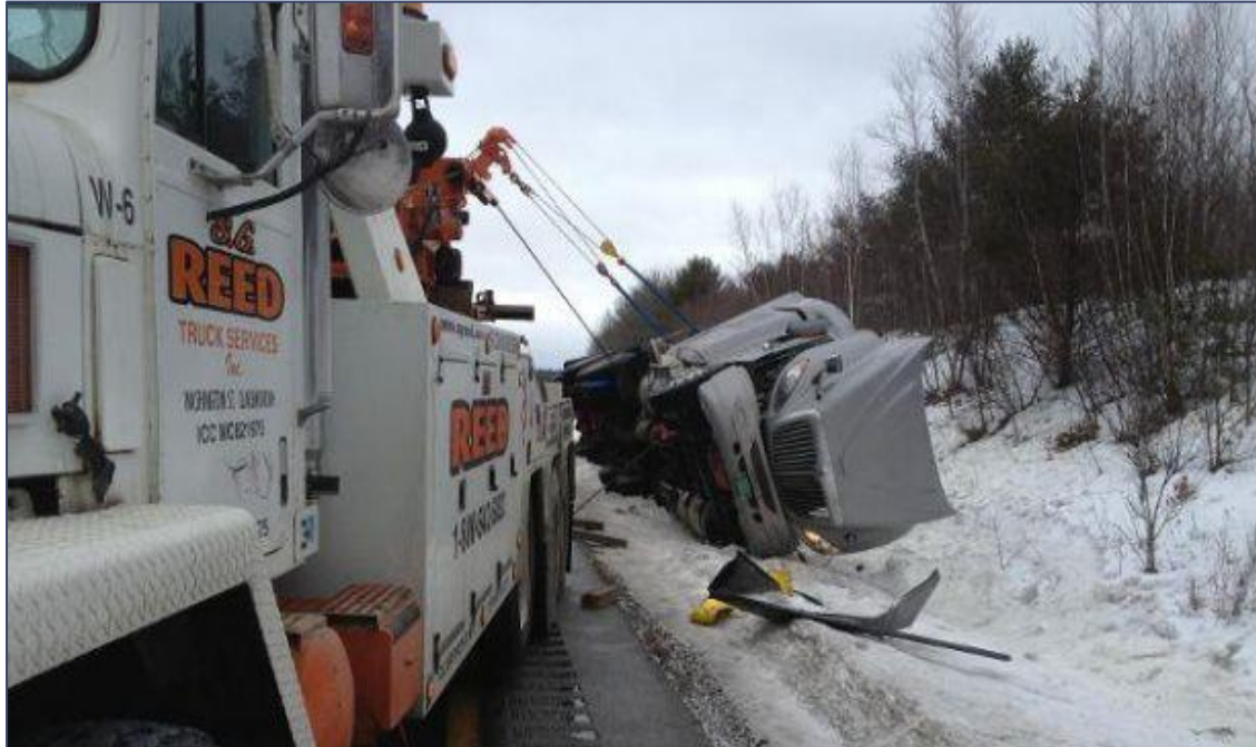
Icy roads contributed to a 65,000 gallon milk truck overturning and spilling of milk on I-89 in Sutton, March 7, 2013